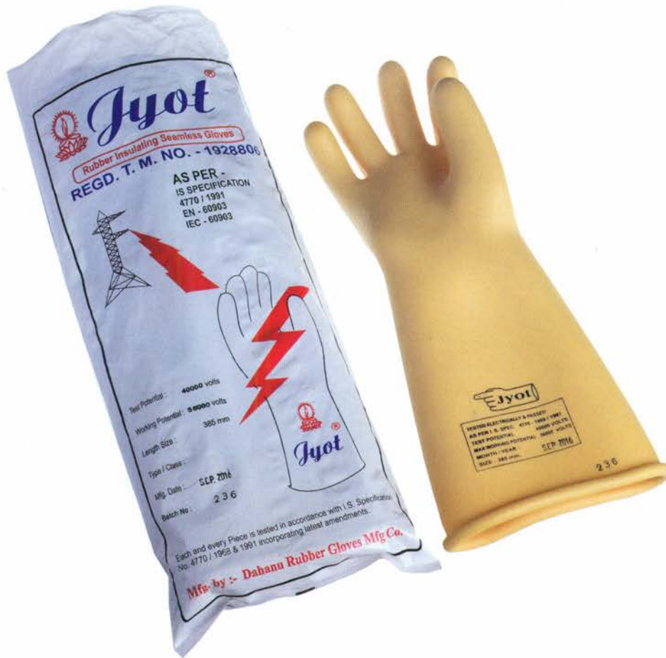
TABLE OF UNIVERSALLY ACCEPTED “JYOT BRAND” ELECTRICAL RUBBER HAND GLOVE IS GIVEN BELOW:-

JYOT gloves are produced from specially compounded Latex that offers excellent dielectric properties combined with great flexibility, strength and durability.